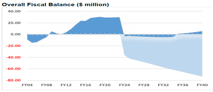
Fiscal Cliff Chuuk