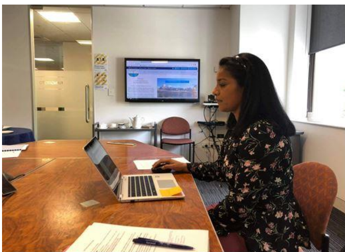
Learning Management System presentation to the Board