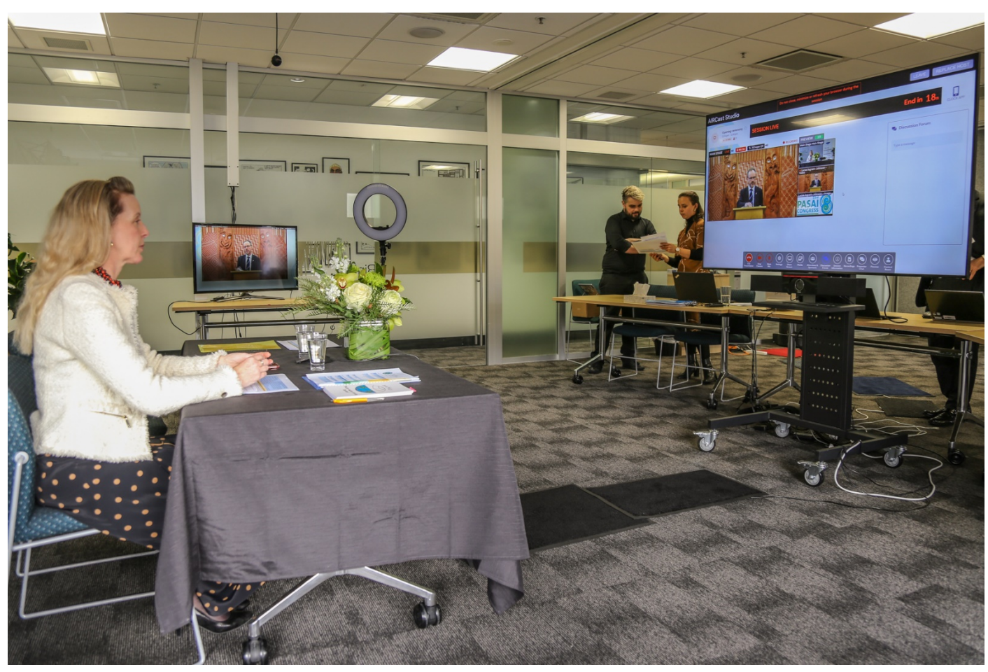
View from the facilitators table, with a sneak peek behind the scenes.