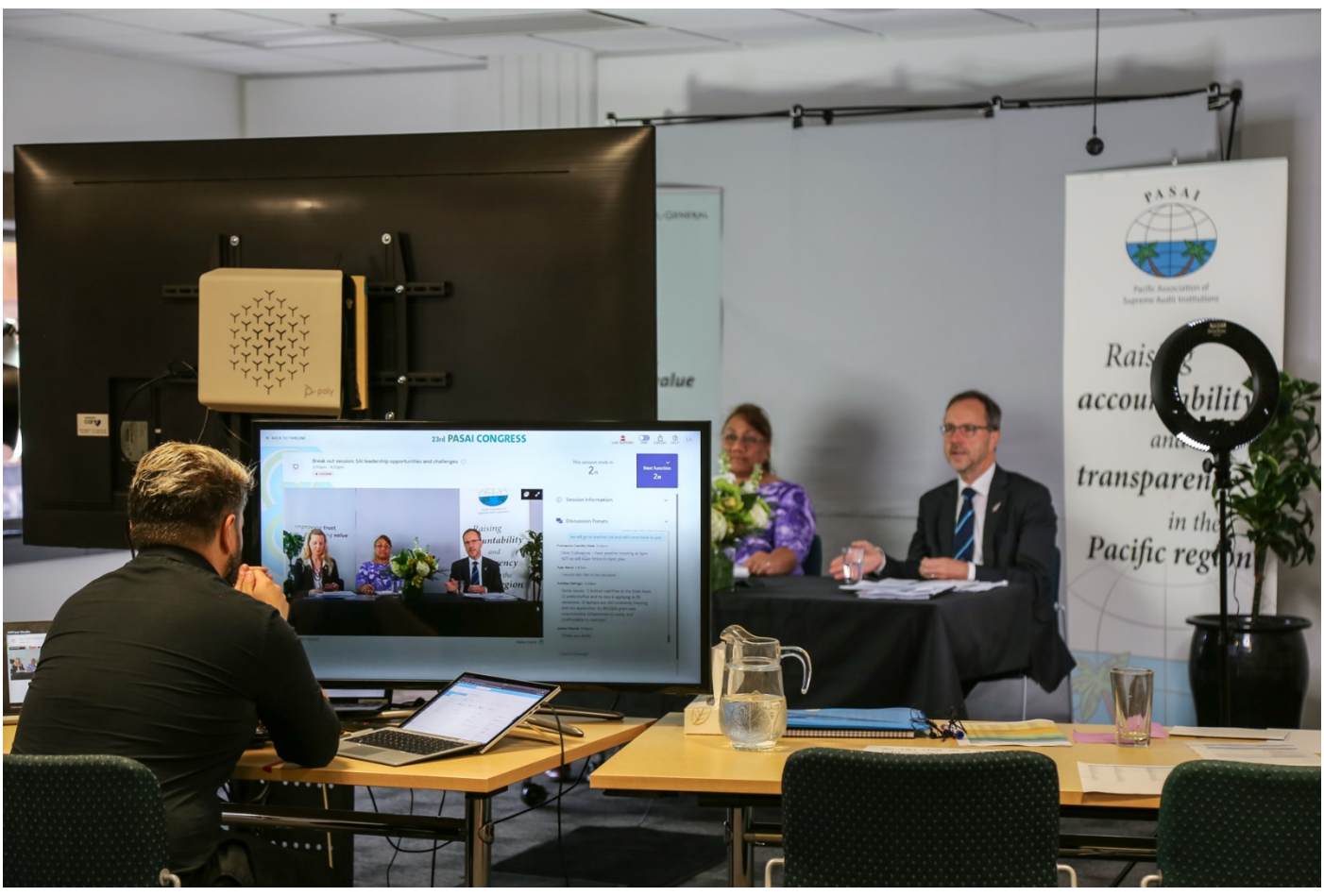
Live broadcasting from the New Zealand Office of the Auditor-General's Wellington office.