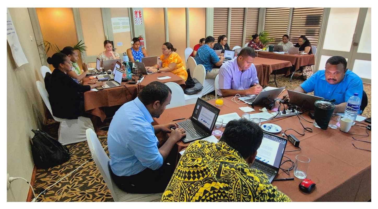
SoAQM workshop participants during training