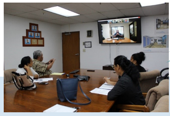
APIPA's principal meeting

In May, the POPA conducted a workshop on government ethics and payroll processing and accountability for employees of the Department of Treasury and Administration (DoT&A) and the Administrative Officers of various departments, offices and agencies