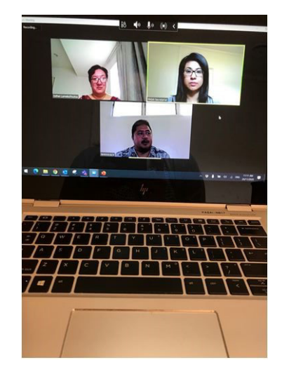
Coaching session: SAI Samoa