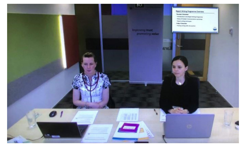
Report Writing training (December 2020)

Our recently launched Learning Management System (LMS) is a centralized repository of our capability development material, and is a key part of our digital transformation. It provides us with a platform to host our online courses and supplementary material, including an integration of multimedia content, and also allows for an interactive element to be built into programme delivery. We are committed to improve on what we deliver and evaluate our programmes to build in a continuous improvement loop into our programme cycle.