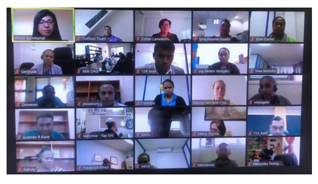
Human Resource Management programme (August 2020)