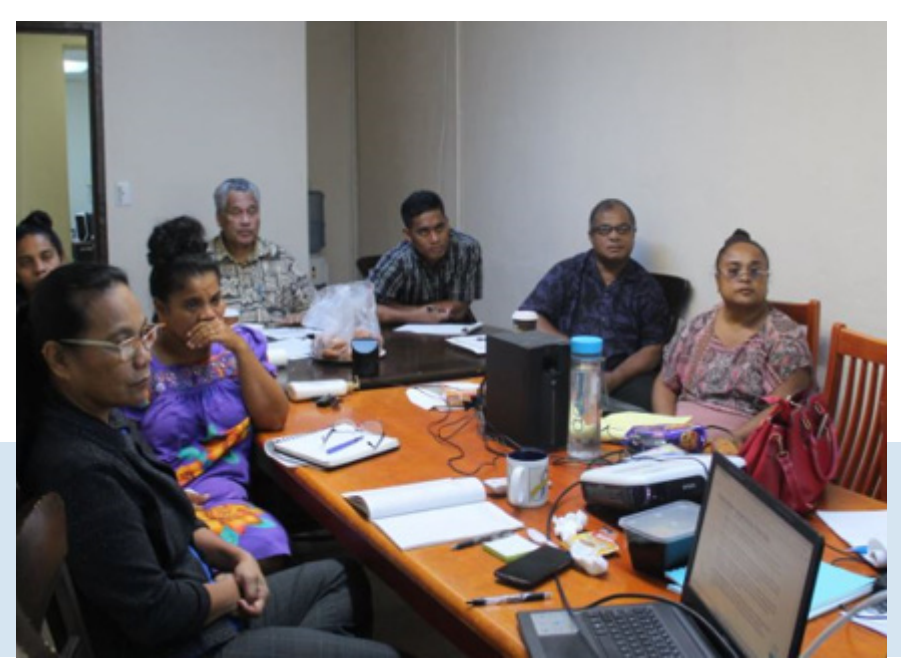
SAI Pohnpei participating in the Communications: Strategy and Implementation workshop – October 2020

From October – December, we delivered a range of workshops and coaching sessions to strengthen the communications function of a SAI. This included training on (i) developing and implementing a Communications Strategy and (ii) Report Writing - delivered in collaboration with the Office of the Auditor-General, New Zealand. The Secretariat team has also virtually delivered a presentation on Quality Assurance during the 31st Association of Pacific Islands Public Auditors (APIPA) Virtual Conference in August 2020.