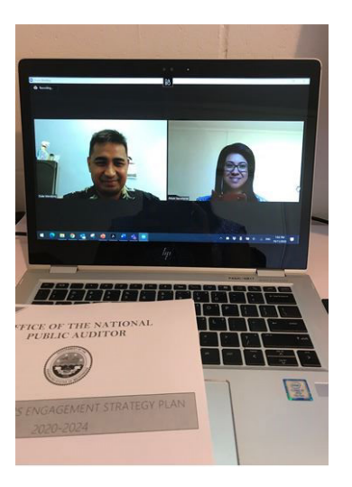
Coaching session: SAI FSM National