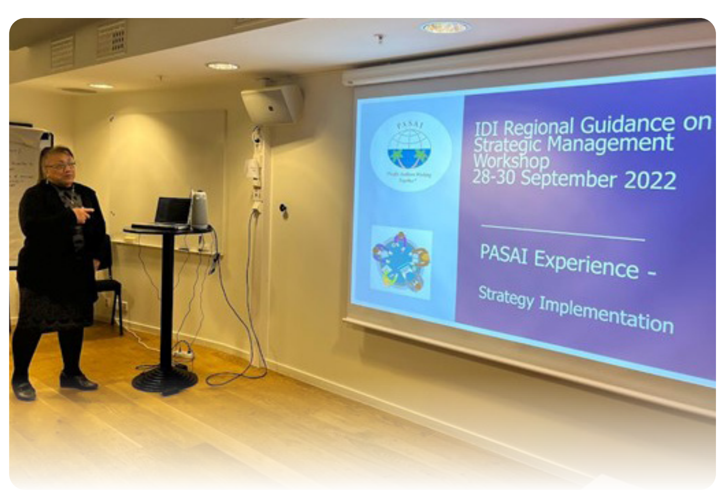
Our Director of Practice Development presents on strategy implementation at the workshop

Our Director South participated as PASAI resource person in IDI Auditing for Impact initiative project meeting in August. She is working with IDI and three other members on drafting an Auditing for Impact Playbook . This guide is designed to assist smaller as well as larger SAI offices reach their strategic audit goals by using different 'plays' or strategies of what has worked well for other SAIs globally. It will complement handbooks which are more process oriented with templates and illustrations.