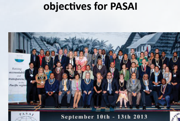
16th PASAI Congress 10 - 13 September Hagana, Guam Significant Events: