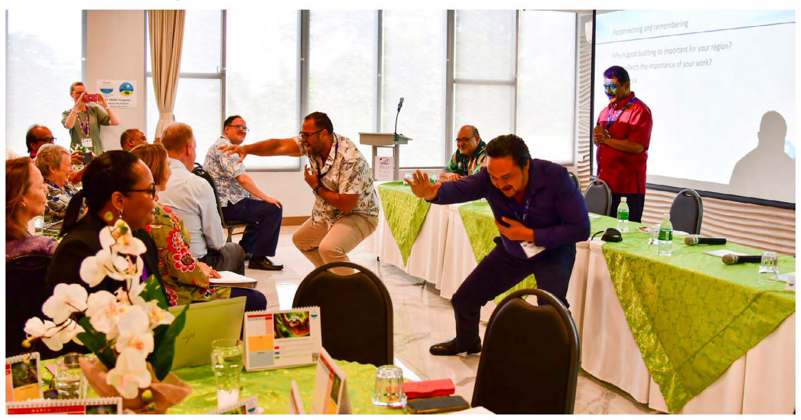
Performance of a 'haka'