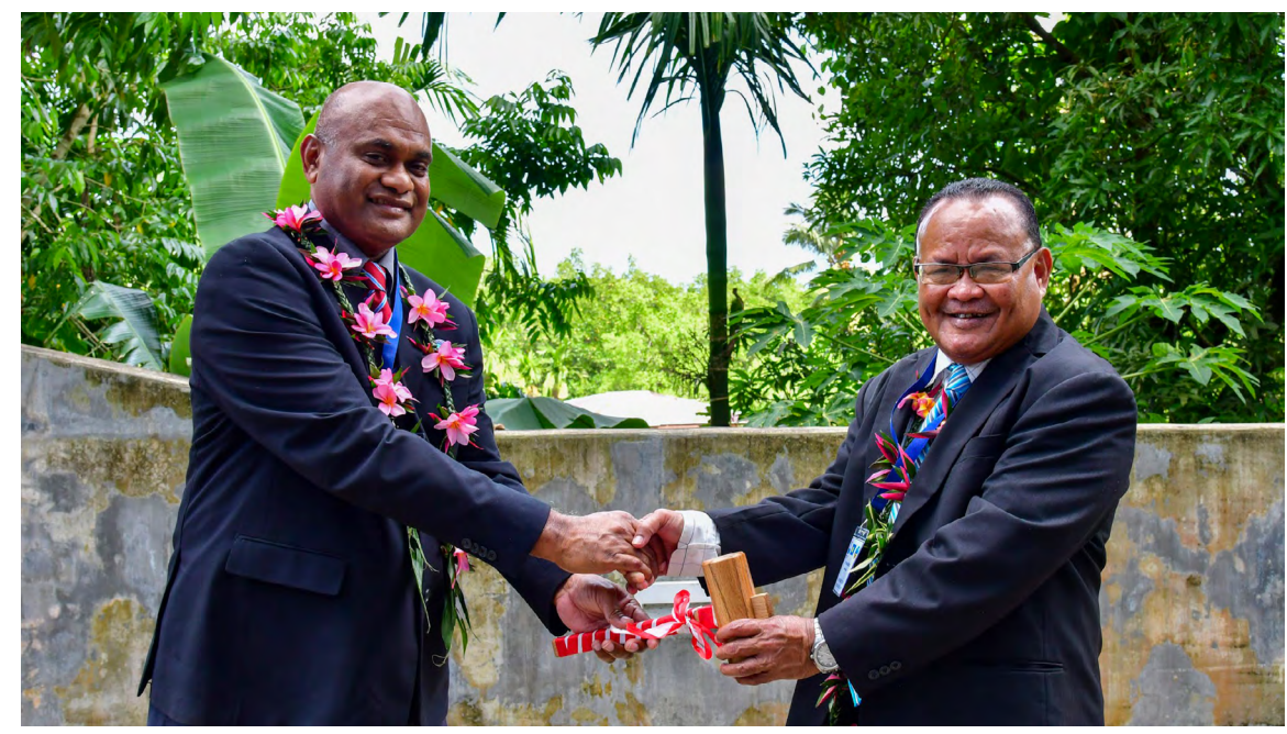
The ceremonial handing over of the chairperson's gavel