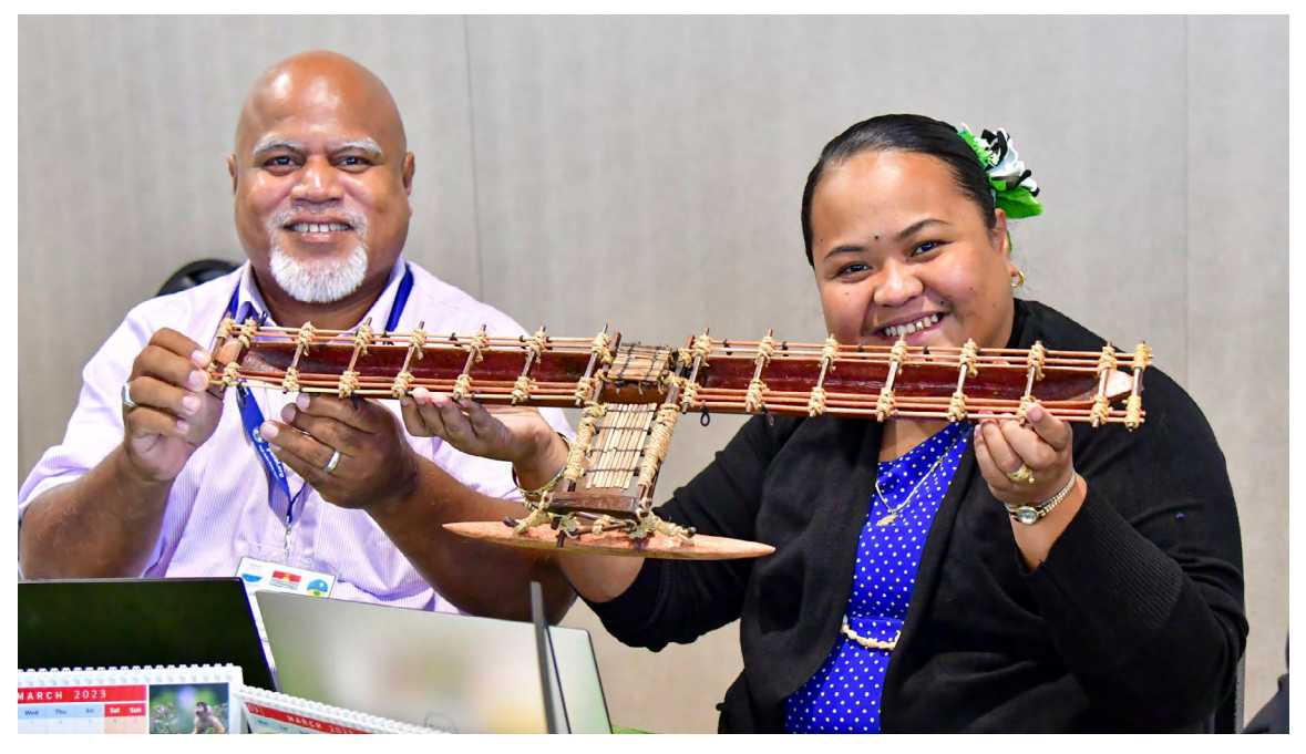
The model canoe, symbolic of a Pacific SAI