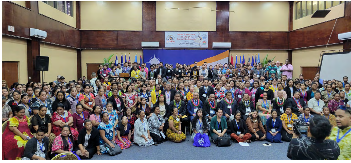
Conference participants

The theme for the conference was "Shining a Light on Public Accountability". One of the founding principles of APIPA is to promote the use of public resources and strengthen the auditing and accounting profession across its member jurisdictions. Since its inception, APIPA has offered professional and capacity development trainings to its members. A total of 2,190 course certificates were awarded to 406 participants, indicative of 13,804 continuing professional education units being accrued during the conference.