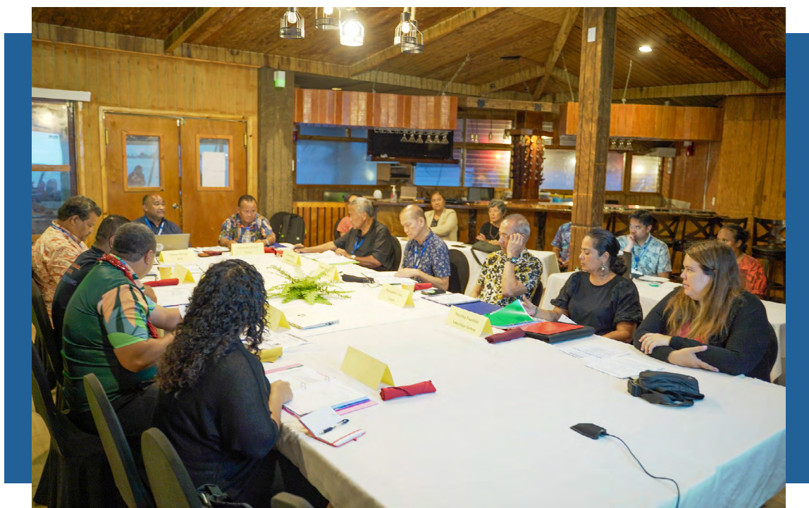
APIPA Principals and other observers at the Executive Body's annual meeting

The APIPA Principals (Executive Body) also held its annual meeting during the week.