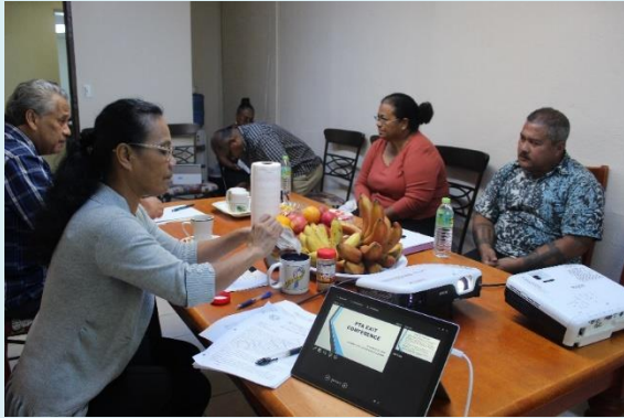
Pohnpei Transportation Authority (PTA) exit conference

For the meantime, while there are still travel restrictions, our conference room will be our venue for learning together.