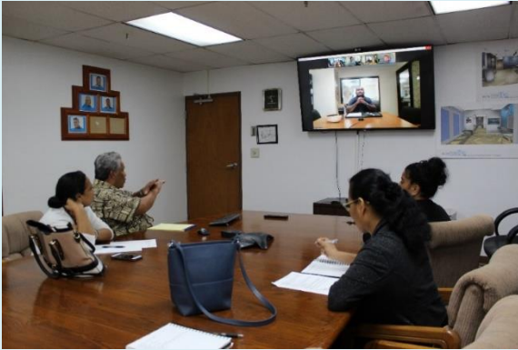
APIPA's principal meeting

Black Lives Matter (BLM) aside from COVID-19 is a big news this month. It created chaos and divisions among Americans. We are grateful for not having that kind of chaos in Pohnpei. In this unprecedented time, we found innovative ways to continue working and learning, at the same time, sharing our knowledge with other government agencies. The first virtual APIPA principal's meeting was also held this month. The meeting was attended by Public Auditors of Marshall Island, Pohnpei State, Chuuk State, Yap State, Kosrae, National Public Auditor, Fiji, American Samoa, Guam, Palau, and Commonwealth of Northern Mariana