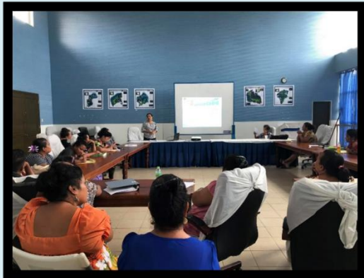
Workshop conducted by POPA

Islands. During the meeting, the US Graduate School discussed the updates of peer review, US Graduate School Training for 2020 and the status of APIPA registration as a non-profit organization.