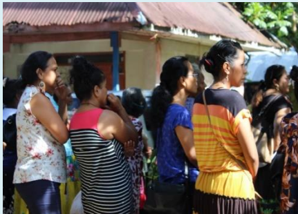
POPA employees show their support to Public Auditor during the burial of his sister.