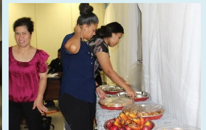
Of Course, refreshments (courtesy of ONPA)