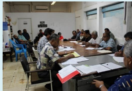
Exit Conference at Department of Land