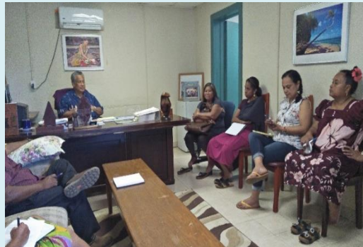
Monthly Staff Meeting

With so many things going on, it was business as usual for POPA in January. POPA had a staff meeting and held an