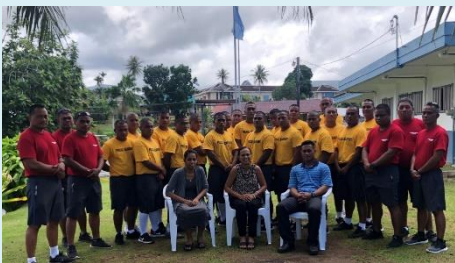
CID with Police Academy Trainees and Policemen

This month kicked off a workshop on “Strengthening SAI Human Resource Management Capacity” provided by Pacific Association of Supreme Audit Institution (PASAI). The workshop was provided due the request of eight (8) SAI to strengthen their organizational capability in managing and handling matters related to human resources. Pohnpei SAI has already drafted the Human Resources Strategy for the review of the Public Auditor.