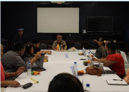
Entrance Conference at Department of Health