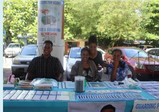
Compliance Investigation Division participated in the United Nation Day

POPA participated in the workshop provided by PASAI for communication strategy. Our office acknowledges the importance of Communication strategy in the promotion of the value and benefits of our office to different stakeholders. We are in the process of updating our current strategy to respond to current situation we are facing based on the available resources the office currently have.