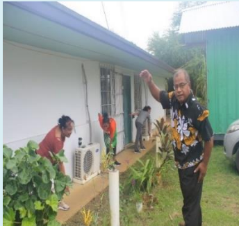
Time to be physically and mentally healthy.