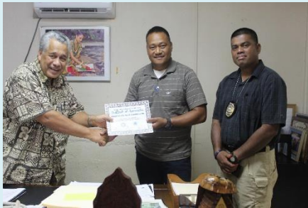
Public Auditor receiving certificate of appreciation from UN and Police Academy