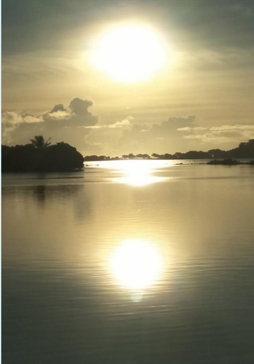
Sunrise at causeway Pohnpei