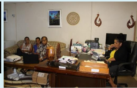
Human Resources Workshop

We cannot control what happens to us, but we can control our attitude towards what is happening around us. Our small gestures can have a huge impact in one’s life. We have to be kind to one another.