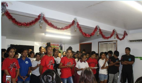
Youth 4 Change

The Annual Report is currently being finalized by the Public Auditor to be published and distributed to different stakeholders. We are also proud to announce that we are in the 3 rd year of publishing “Year in the Life of POPA”. PASAI helped us with the initial publication and we are thankful for their support. We continued the project to share with our stakeholders about our work (value and benefits) and other activities we undertake during the year.