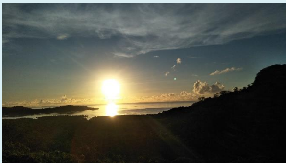
Sunset in Pohnpei