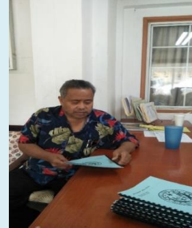
Distribution of annual report to legislators