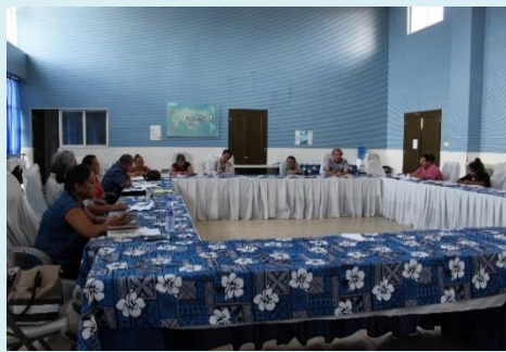
Entrance Conference for COVID-19 audit

As death counts caused by COVID-19 continued to rise, the Black Lives Matter protest also continued worldwide. POPA also continued to build strong relationship with different stakeholders through entrance and exit conferences and collaboration with the youth sector.