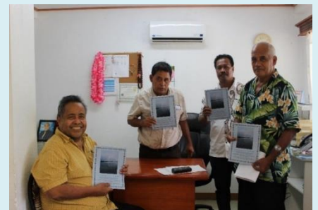
Distributions of Year in the Life (2019) to different stakeholders

We smile even for the smallest things that life has to offer. After a little delay, POPA was able to distribute its “Year in the Life of POPA” (Year 2019).