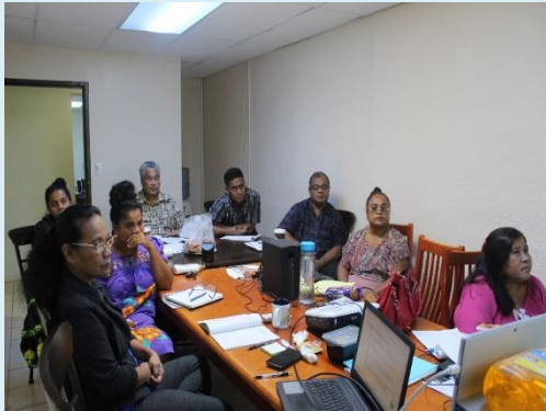
Communication Strategy courtesy of PASAI

President Trump and his wife, First Lady Melania, both tested positive for COVID. Our money, fame and status cannot protect us from illness. At the end of the day, we are equal , we are susceptible to illness like COVID-19.