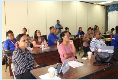
Plenary session at Central Facility Building at Palikir

The Association of Pacific Islands Public Auditors (APIPA) has completed its 31 st annual conference. This is the first virtual conference due to the lockdown brought on by COVID-19 pandemic. The conference which was held in virtual setting ran from August 3 to 14, 2020. The APIPA conference provided the auditors four (4) hours a day of learning for a total of forty (40) continuing professional education credits (CPE). The virtual conference is an innovative approach by the US Graduate School to provide meaningful conference even in the midst of the pandemic. There were over eight hundred (800) participants registered in this annual conference; 12% from private sectors and 88% from the government sectors of Guam, US Virgin