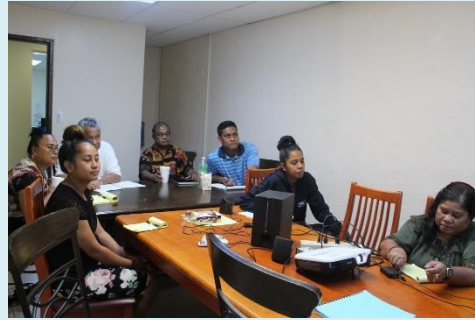
Auditing grants workshop provided by PITI-VITI